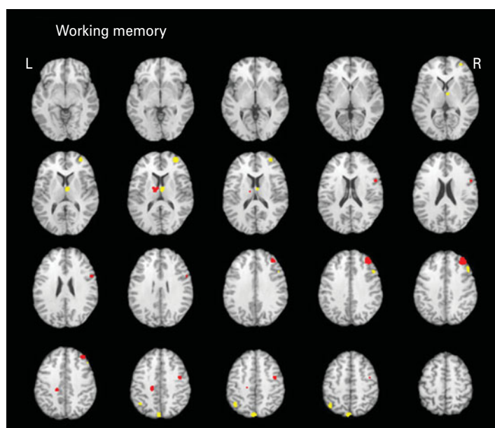
Fig. 3. Above-threshold brain activations for contrasts of controls greater than relatives (red) and relatives greater than controls (yellow) for working memory studies. L, left; R, right.

studies reported both hypo- and hyperactivity in the right middle frontal region. This meta-analysis expands the qualitative summary by quantitatively reporting that the abnormal activity of the middle frontal region detailed by individual studies was not in distinct areas, but rather was localized to statistically overlapping areas. Therefore, this finding suggests that there is a region of the middle frontal area that functions differently in the relatives of patients, resulting in patterns of either hypo- or hyperactivity.